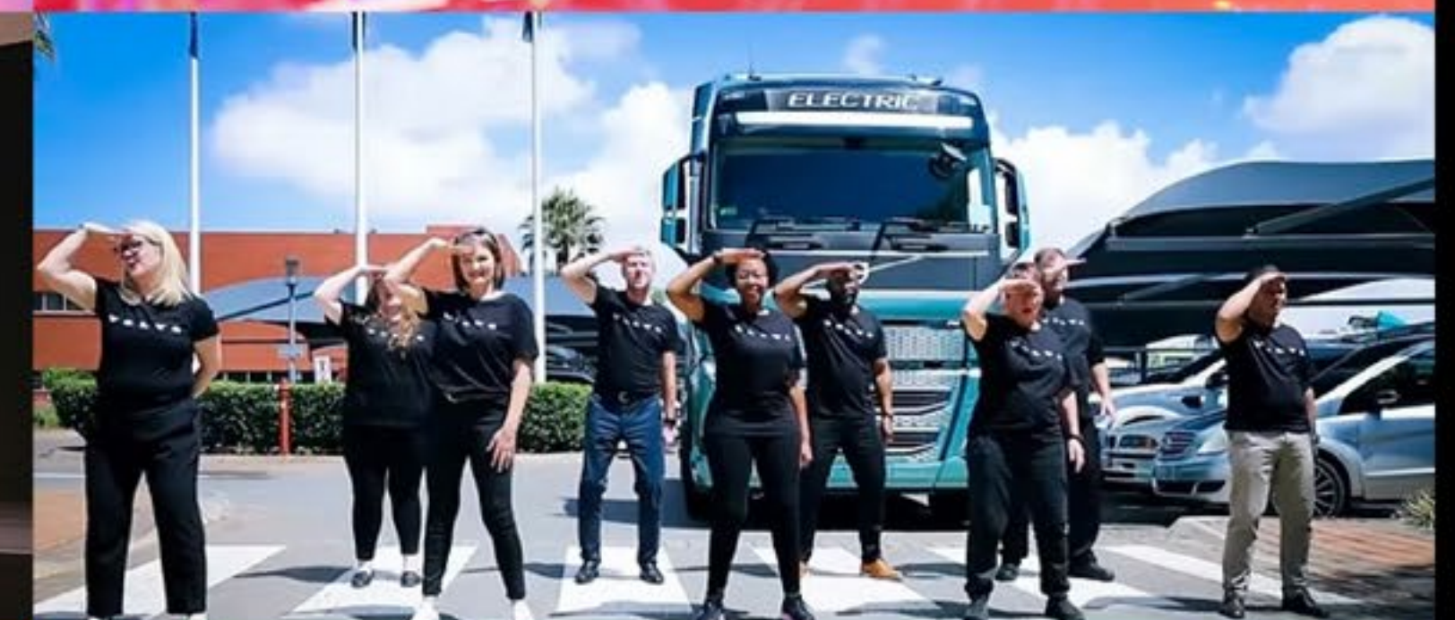
Volvo Trucks Stop. Look. Wave. Campaign