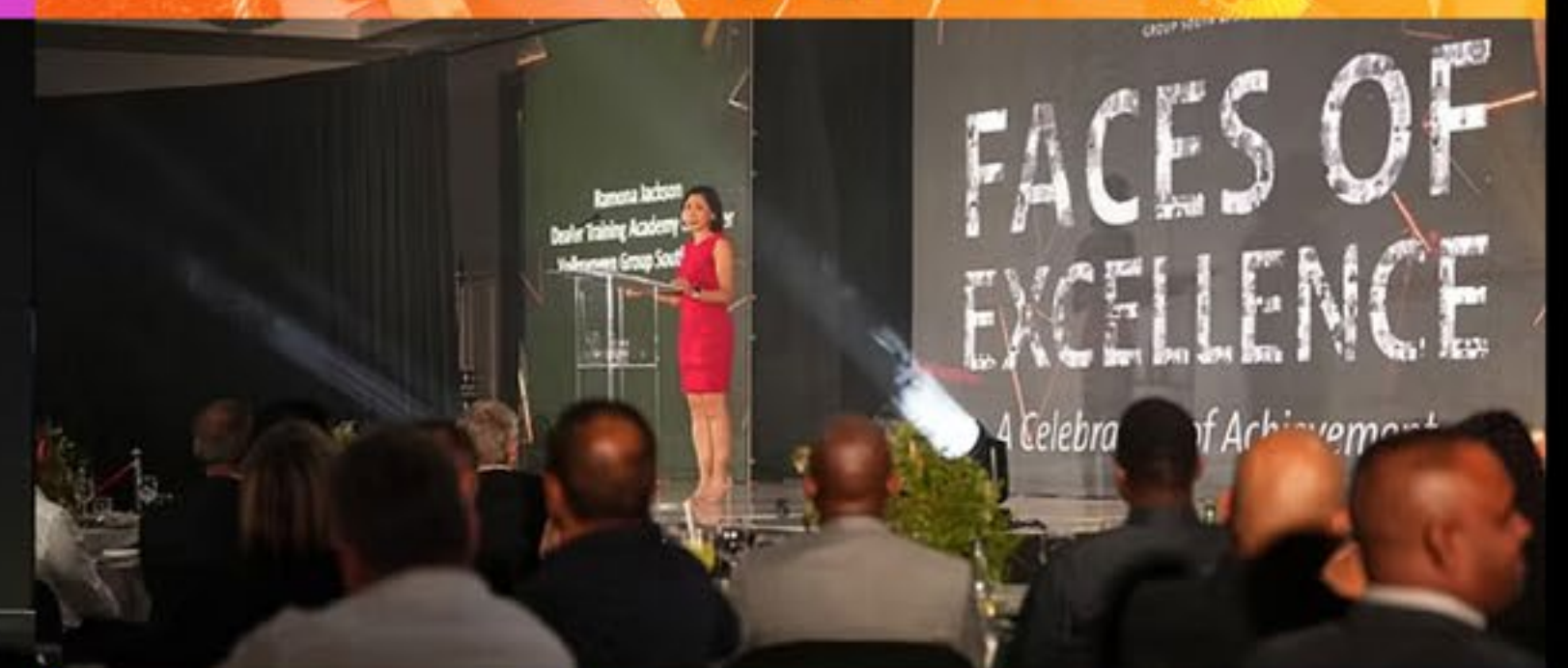
VW Awards | KZN