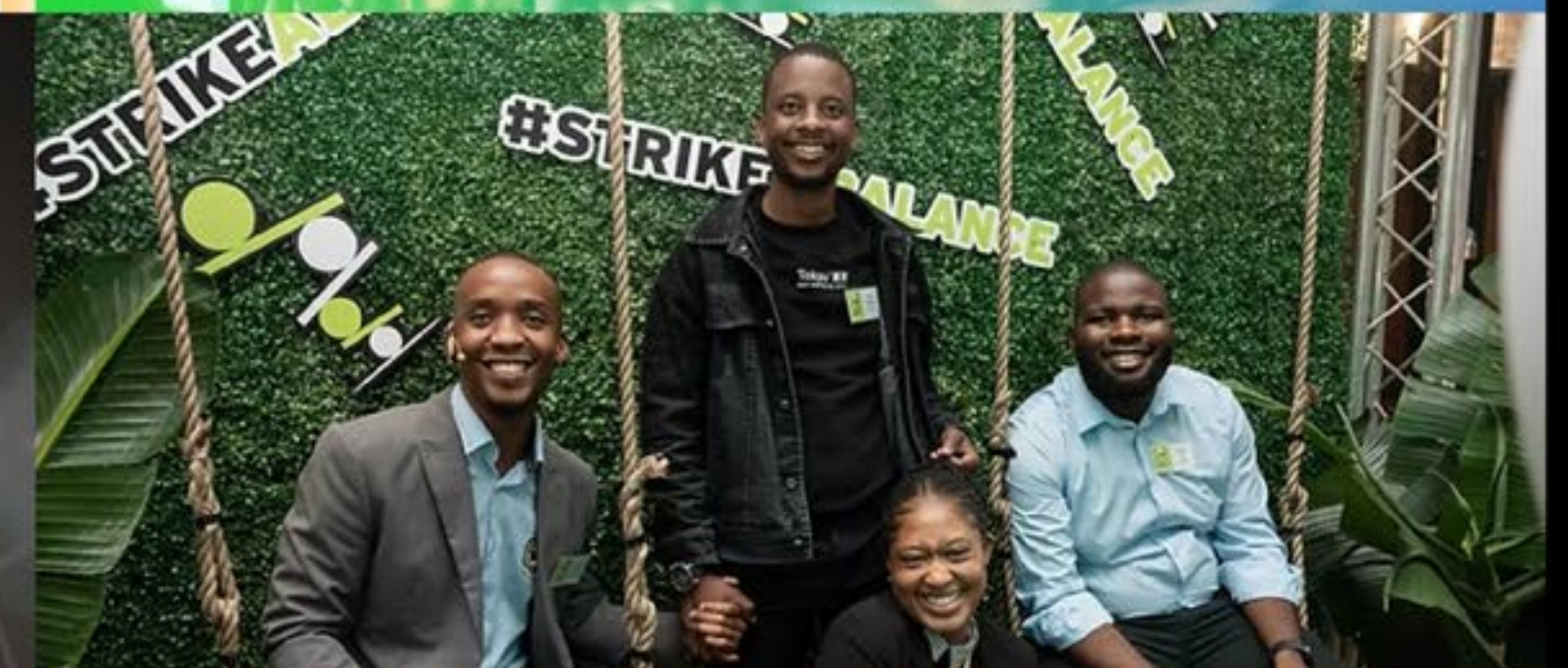
Exxaro PIT Symposium 2023