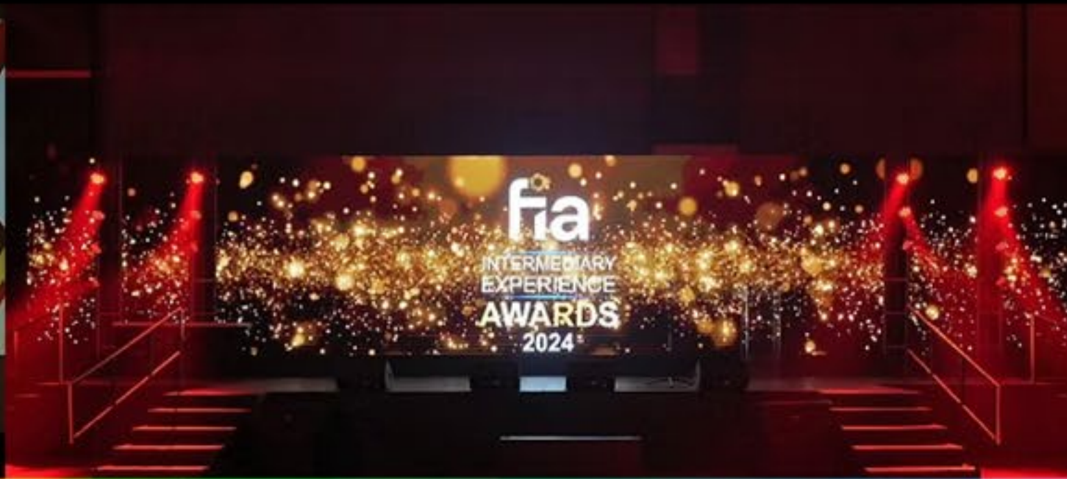
FIA Awards 2024