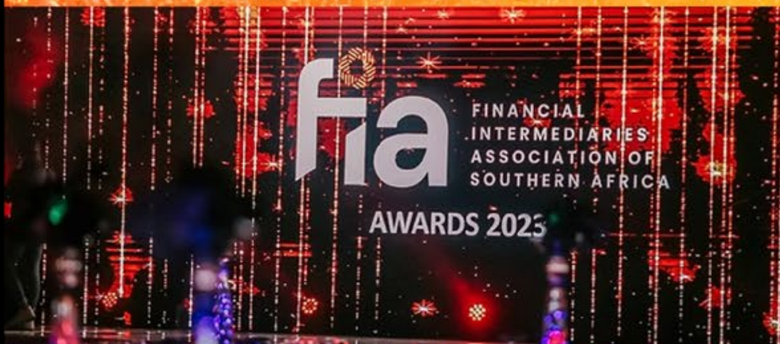
FIA Awards 2023