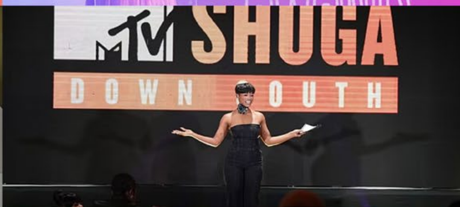
MTV Shuga Down South Season Premiere