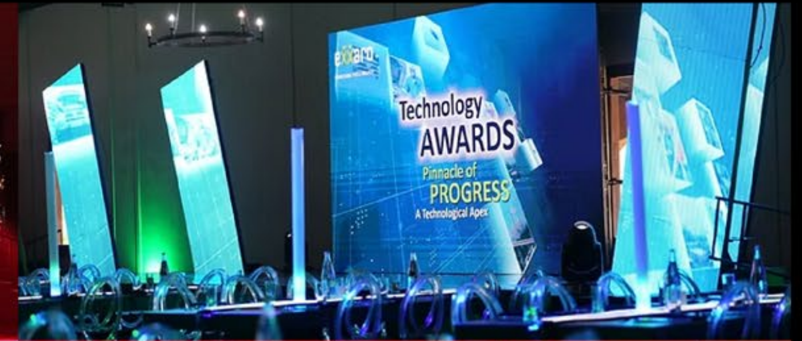
Exxaro Technology Awards 2024