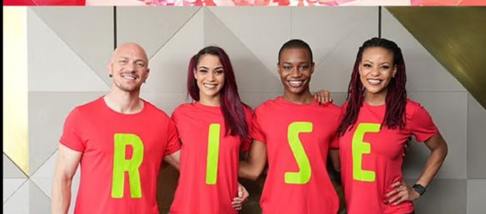
Volvo Trucks People Conference 2024