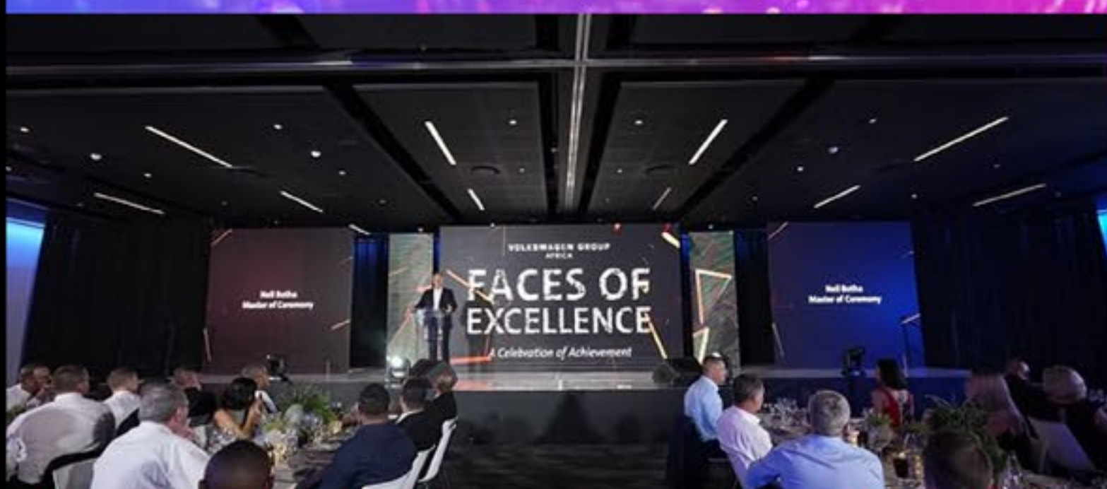
VW Awards | CPT