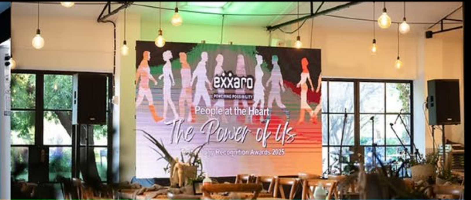
Exxaro 2025 Technology Awards