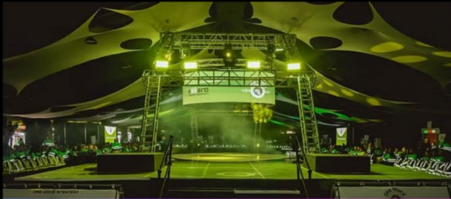
Exxaro 2025 CEO Safety Summit