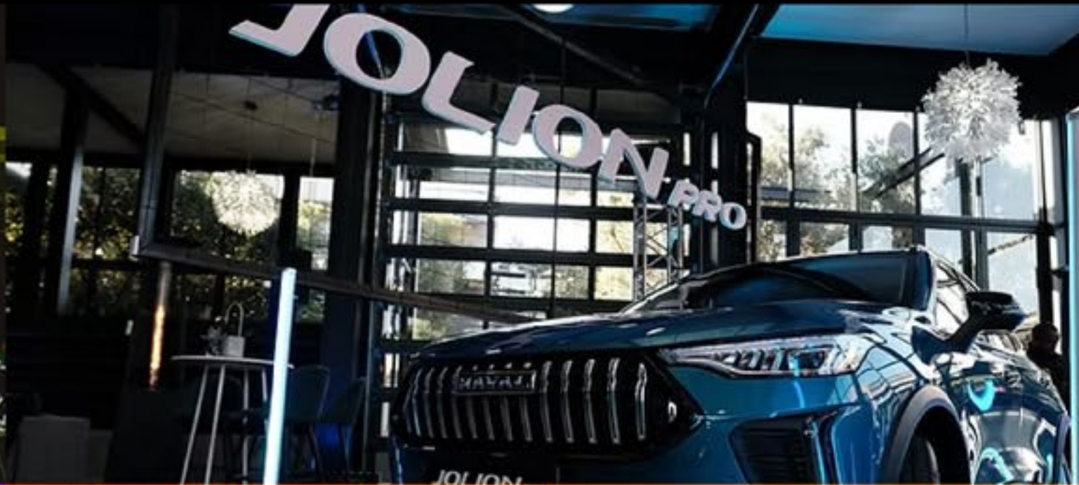
Haval Jolion Pro Launch 2024