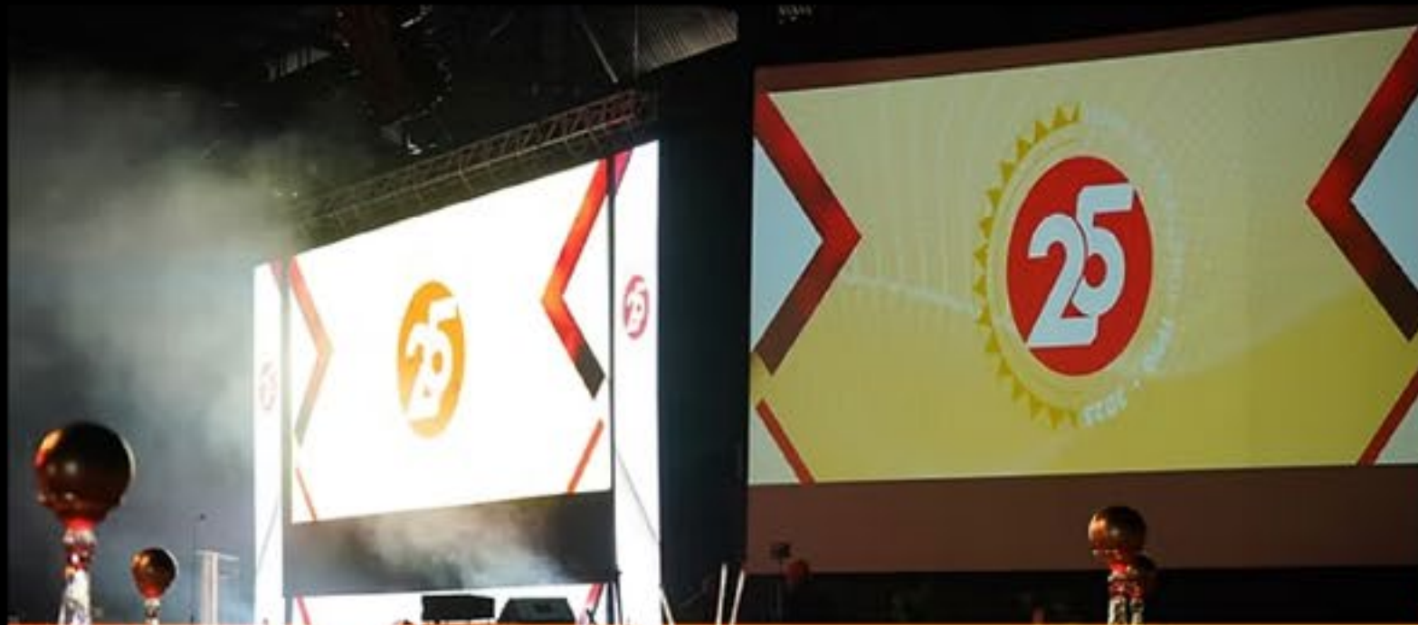
Aurum 25 Year Celebration