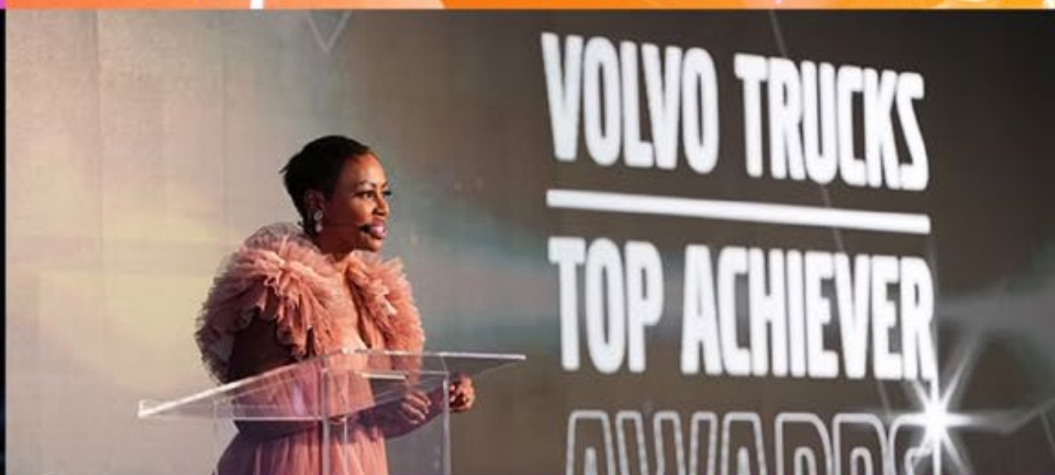
Volvo Trucks Awards 2024