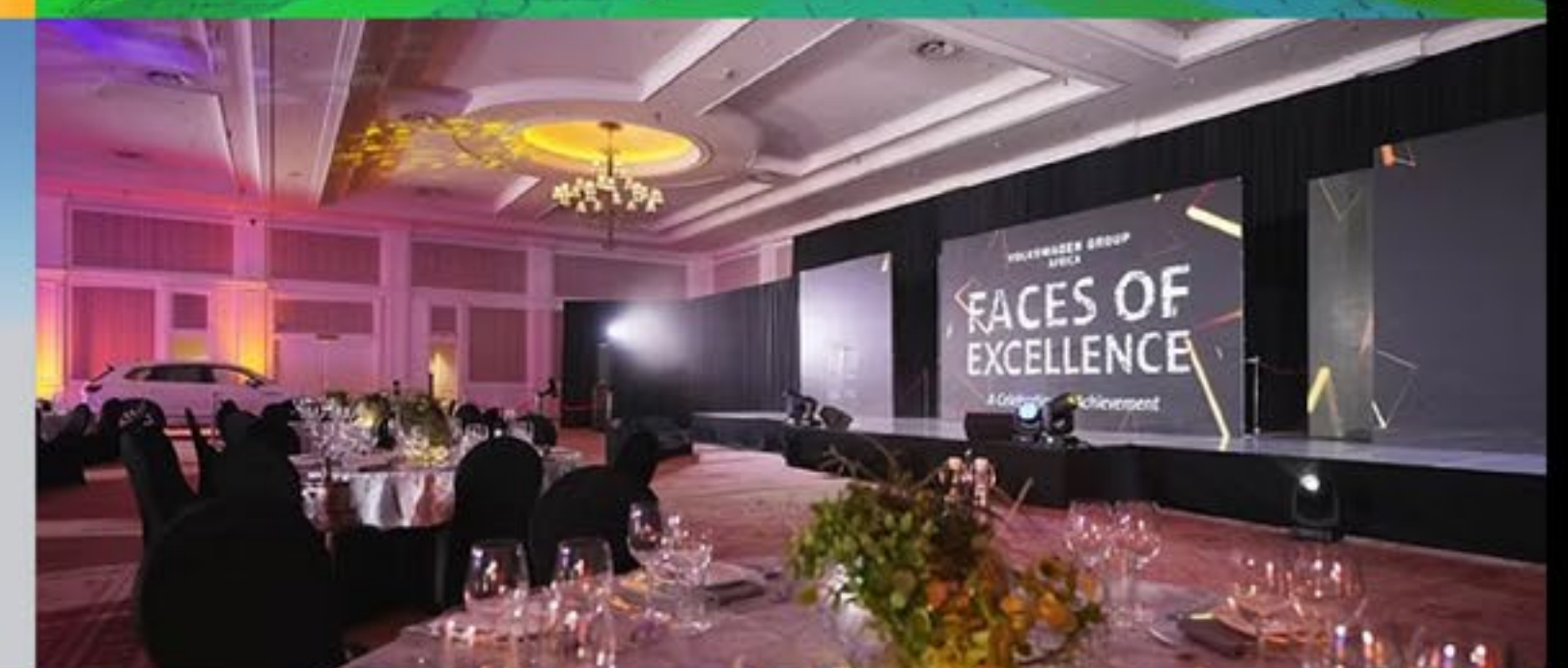
VW Awards | PE