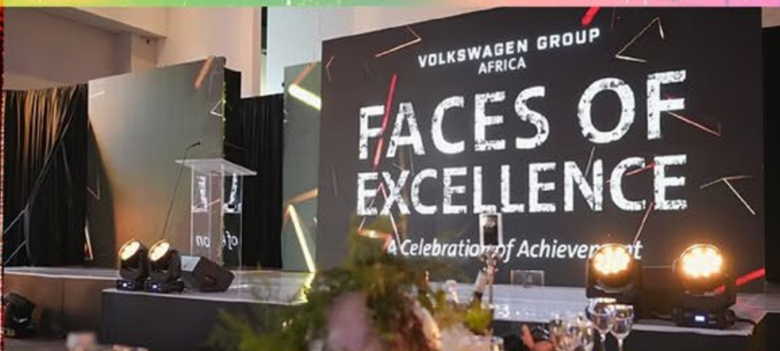
VW Awards | JHB