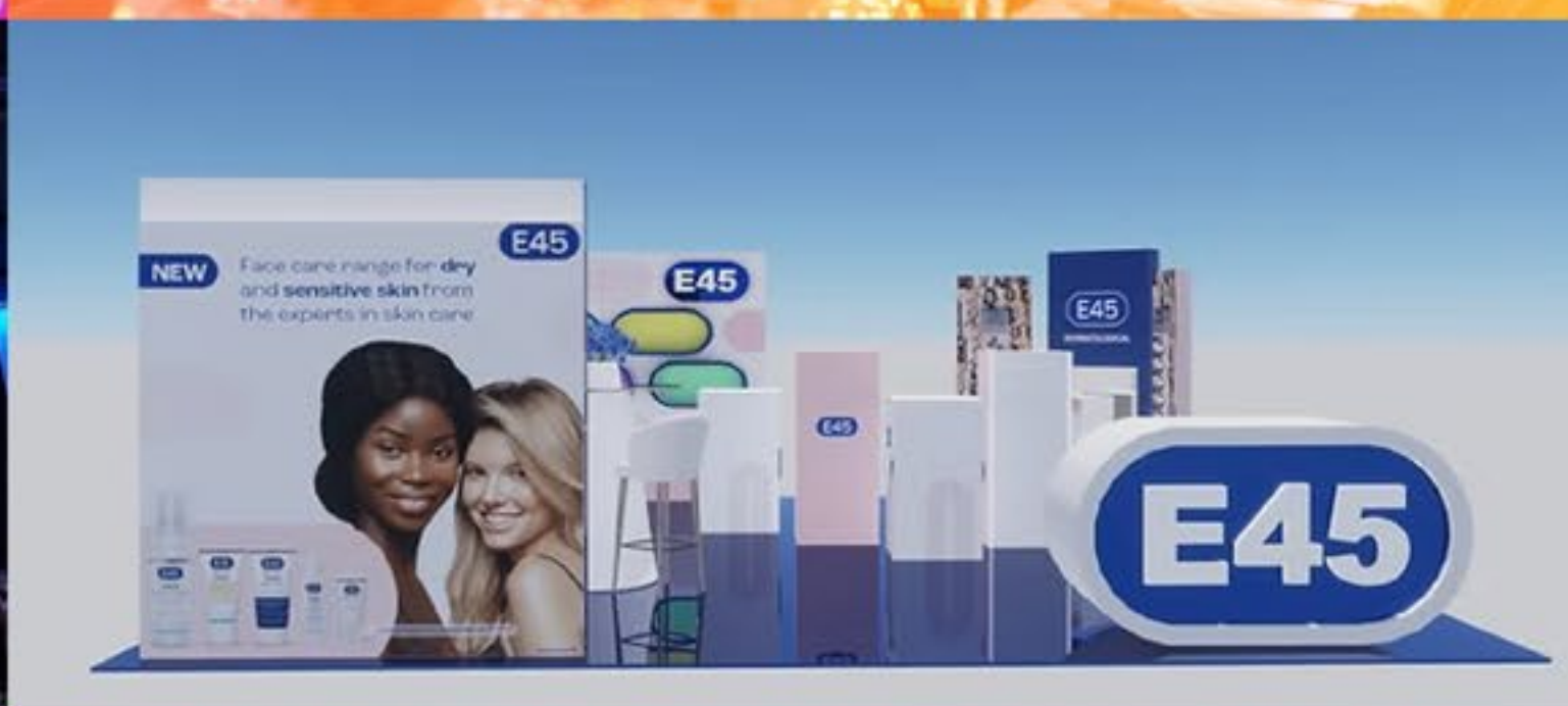
E45 Exhibition Stand Design